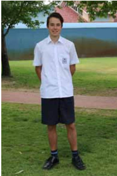
Boys Summer Uniform