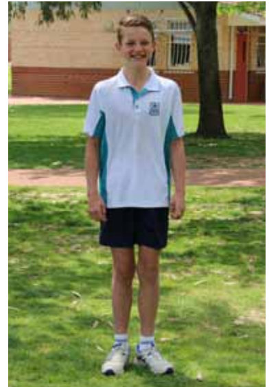
Boys Summer PE Uniform