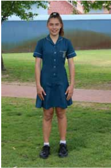
Girls Summer Uniform