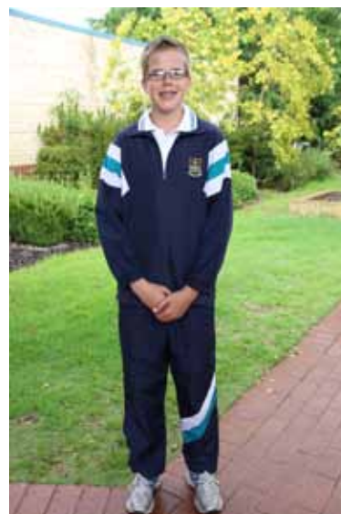
Boys Winter PE Uniform