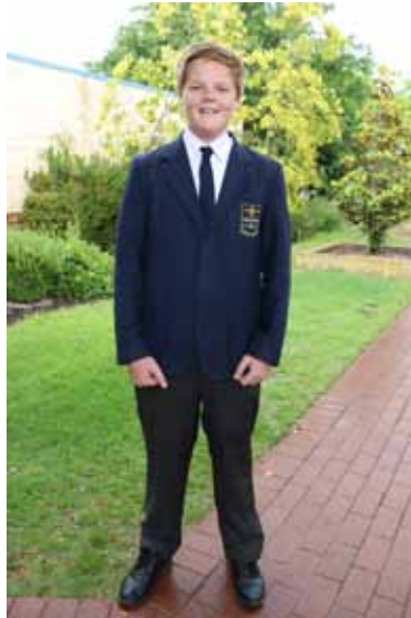
Boys Winter Uniform