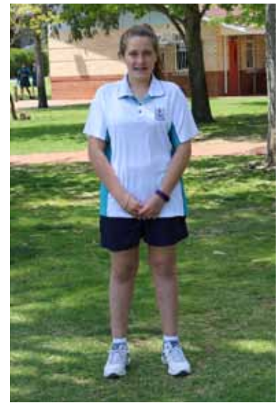
Girls Summer PE Uniform