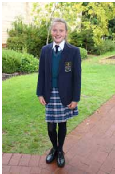
Girls Winter Uniform