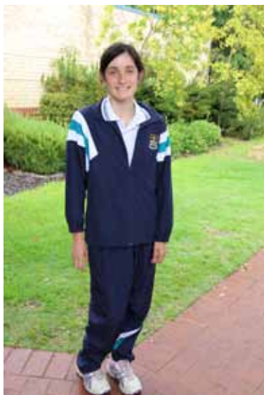
Girls Winter PE Uniform