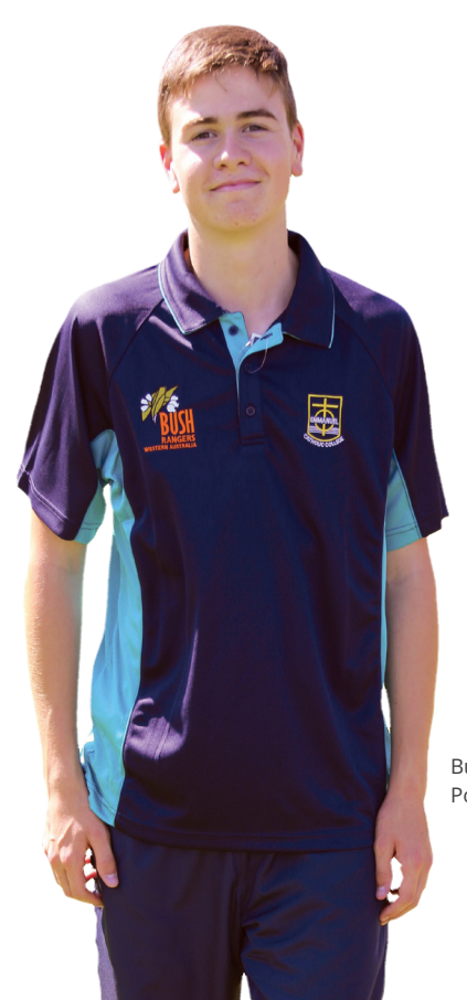
Bush Ranger Polo Shirt

All students are allocated to a House and purchase of their House shirt is a compulsory part of the uniform. Other House accessories are also available from the uniform shop. Specialised clubs also have their own shirts available, such as Bush Rangers and the Drama club.